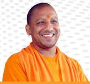
Sh. Yogi Adityanath Ji