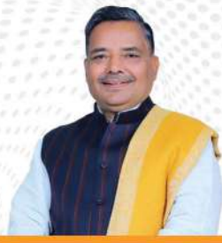
Sh. Jaiveer Singh Ji

Hon'ble Minister, Dept. of Culture, Govt. of U.P.